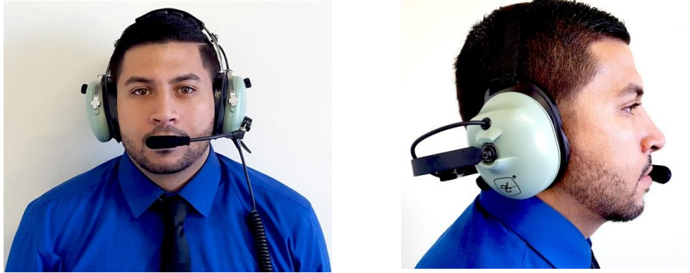
Figure 2: Positioning the Microphone